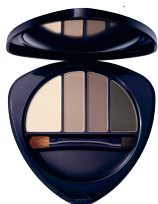
Eye & Brow Palette