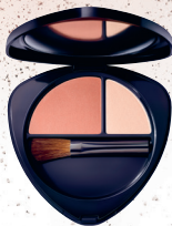
Blush Duo 01