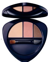
Eyeshadow Trio 04